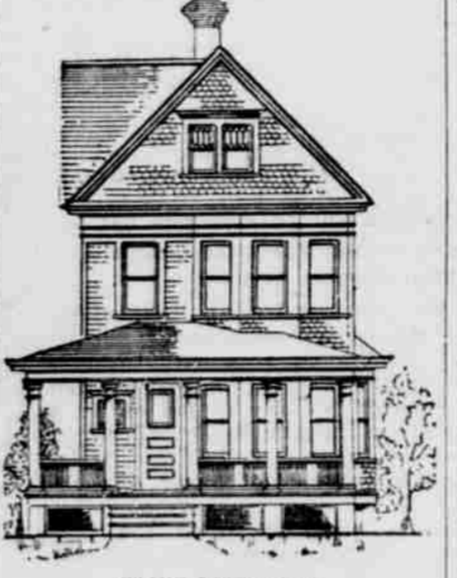
FRONT ELEVATION. named with mullion windows. The bay windows on the front and side are also very attractive features.

A COLONIAL RESIDENCE. Pleasing Exterior and Well Arranged Interior Features of This House. [Copyright, 1902, by George Hitchings, 4 Park row, Times building, New York.] Neatness in design and convenience in plan arrangement, two important items, have been successfully carried out in this design. The exterior is very pleasing to the eye. It is ornamented by a large piazza across the front, and the roof is broken by a gable on one side, the gable being shingled and or-