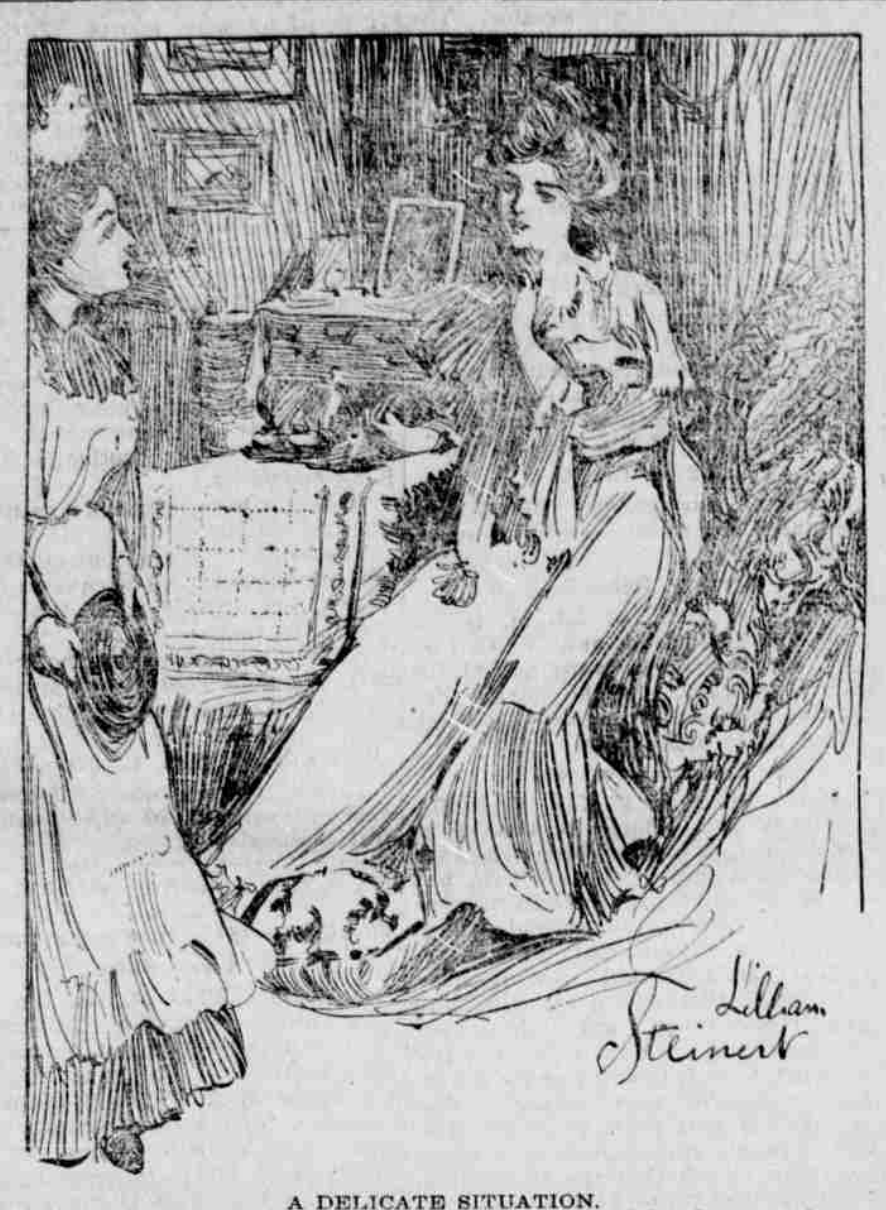
A DELICATE SITUATION. Mistress—What did Mrs. Gusher say when you told her I was out? Maid—She said she would wait until you returned!