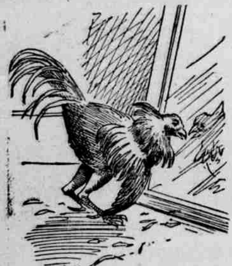
FIGHTING WITH HIMSELF.

One of the gamiest gamecocks in St. Louis, Mo., gave a chance audience a rare treat one day last week. He fought his image to a finish. By chance a mirror had been left in the back yard at the corner of Jefferson avenue and Pine street. The cock was strutting about the yard looking for trouble when suddenly he came face to face with his image in the glass. His fighting blood was up. At last he had met a bird that he considered worthy of his prowess. He eyed the supposed enemy critically. His anger grew as the image mocked him. The feathers began to rise on his neck, and in an