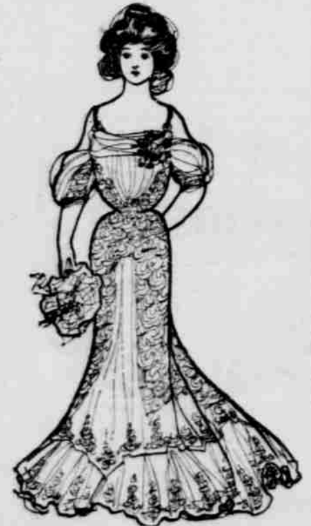
FOR A YOUNG GIRL

The evening sleeve of the moment is a matter of taste. It is made with one single puff to the elbow or tight fitting a la Marie Antoinette with a frill. Some sleeves are composed of seven or eight accordion plaited frills. On many gowns there are no sleeves at all, only shoulder straps composed of jeweled chains or ropes of flowers. If a wom-