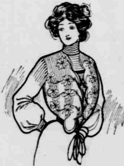
THE LATEST BOLERO.

Tunic skirts showing a double or triple effect are the latest cry from Paris; so is the five flounce skirt. As its name implies, this is composed of five ruffles gored and graduated from nar-