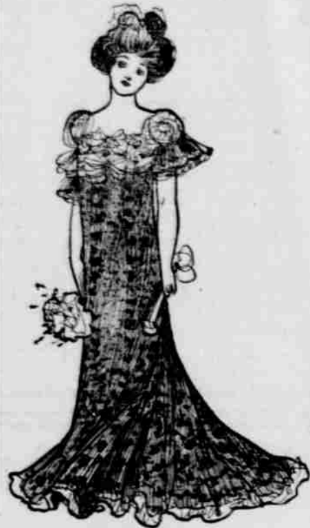
WORN IN "FROCKS AND FRILLS."

Several well known society women have the pretty fad of always wearing a certain kind of flower no matter what time of the year it is. This idea can be carried out by the girl in moderate circumstances if she uses artificial flowers on her evening dresses. It is a chic French notion to loop in ribbons or silver cord with the flowers, and a