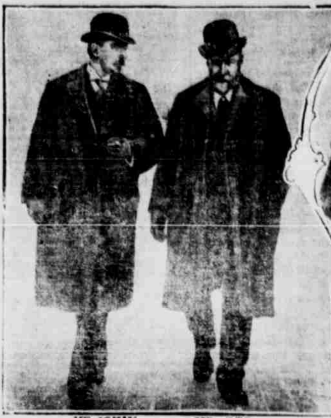
Messrs. Pirrie, Ismay and Lee.