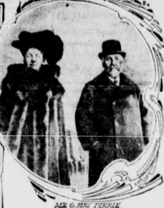
MR & MRS PIRRIE

Messrs. Pirrie, Ismay and Lee, of the Trans-Atlantic Steamer lines, are in the United States from London. They are presumed to be negotiating with J. P. Morgan for the consolidation of ocean steamer lines, or, at least, an arrangement of close traffic schedules for the elimination of competition.