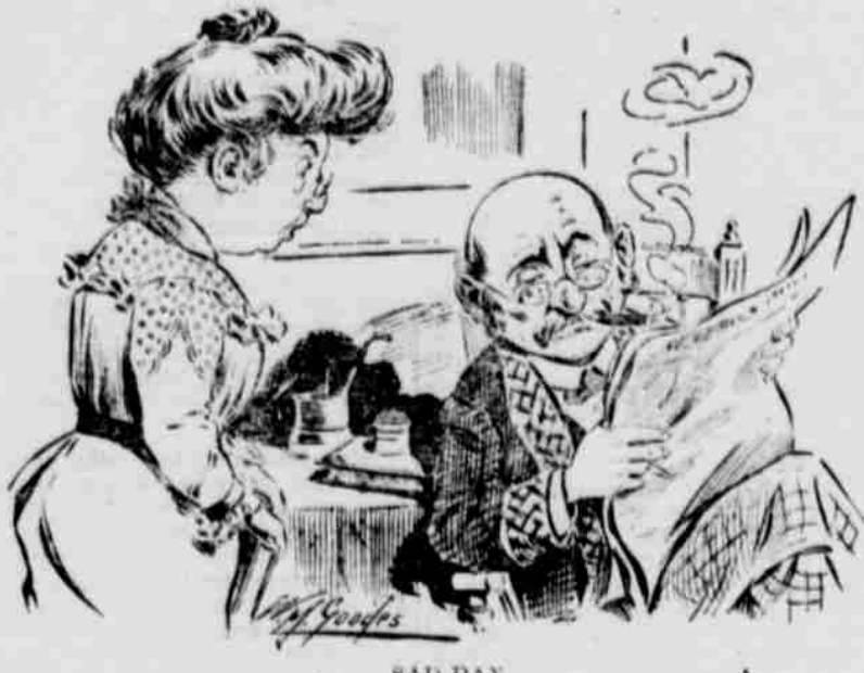
SAD DAY. Mrs. Grumbler—Today is the anniversary of our wedding day. Mr. Grumbler—Well, you needn't remind me of it if it is.

What you buy from us. BIG Stock of WOOD, COAL, SAND & BRICK. ...We do... Trucking & Transferring. Lantz Bros.