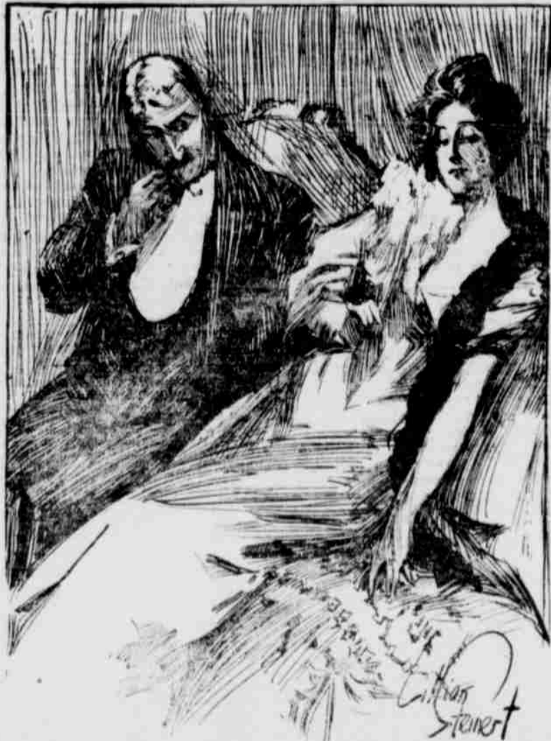
OF COURSE NOT.

OLD NEWSPAPERS TO PUT UNDER carpets, on shelves, walls, or for wrap- ping purposes. Old newspapers in large bundles of one hundred each at 25 cents a bundle at the EAST OREGONIAN office, Pendleton, Oregon.