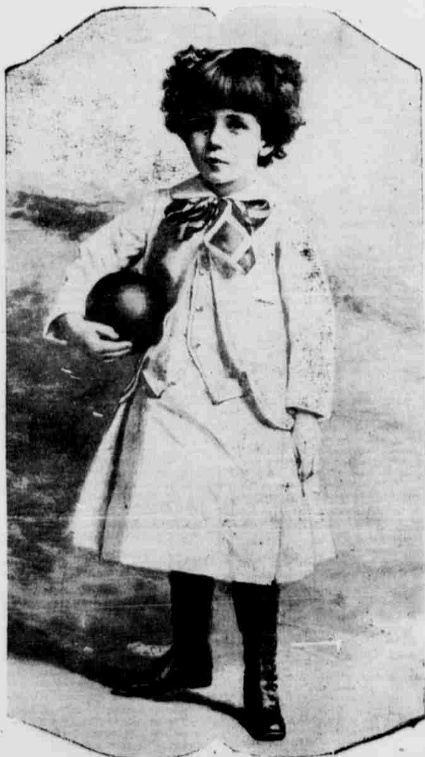
PRESIDENT ROOSEVELT'S SON QUENTIN.

acquired many new and strange delicacies. A hostess who wishes to satisfy the tastes of all her callers has on her perambulating table not the ordinary cut loaf sugar alone for sweetening, but a pair of pretty crystal and silver bottles, from the mouths of which shake on one at a time, small half grain tabloids of saccharine or saxon, as the tea drinkers prefer. The bottles bear engraved letters on their tops the names of their contents, and over against them usually stand a row of three small silver tea caddies or a square repoussed silver box that is divided within into three compartments. The caddies of the box contain three different kinds of tea: pure