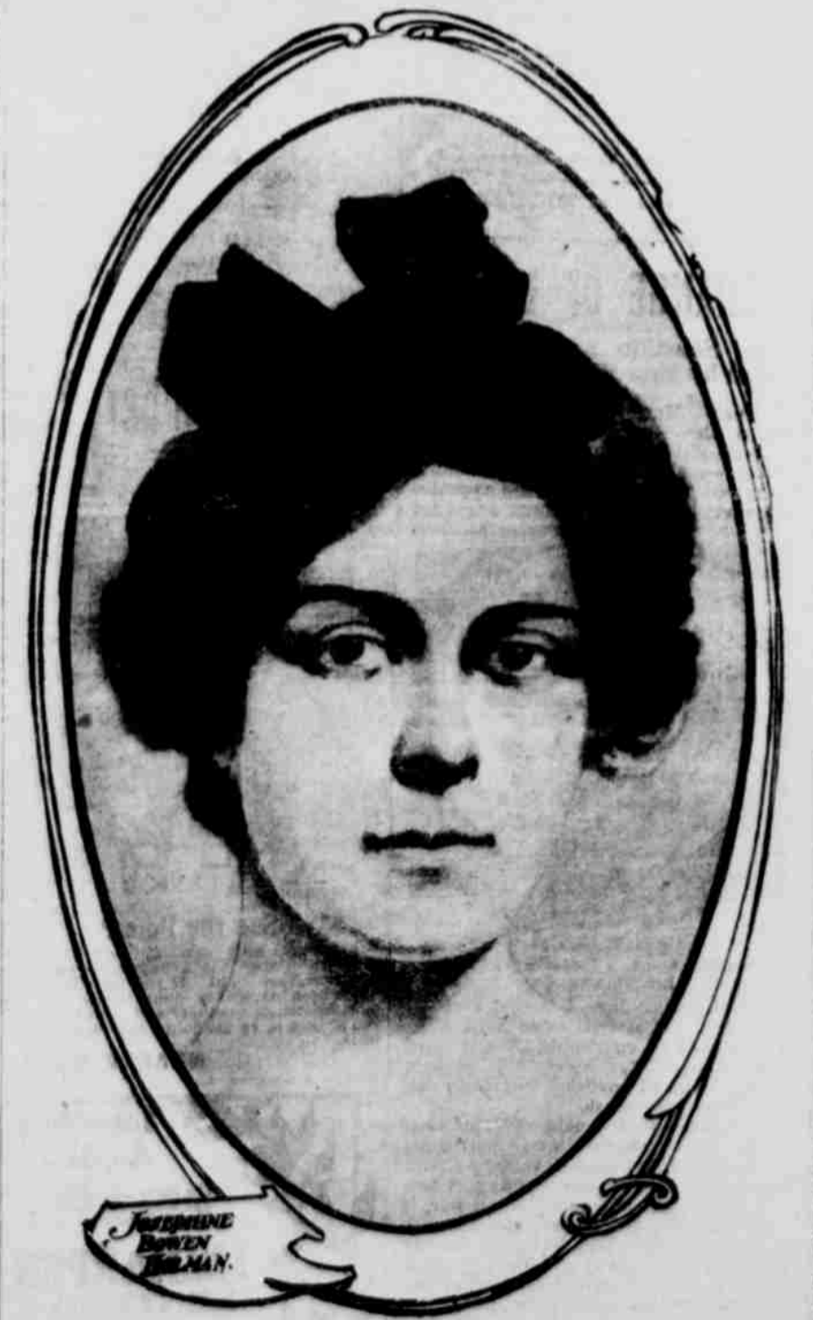
Marconi, discoverer and demonstrator of the principle of the wireless telegraph, will marry a Yankee girl, whose portrait appears here. The date of the wedding has been left to be decided when the great inventor can find time to leave his scientific work and devote a few moments to matrimony.