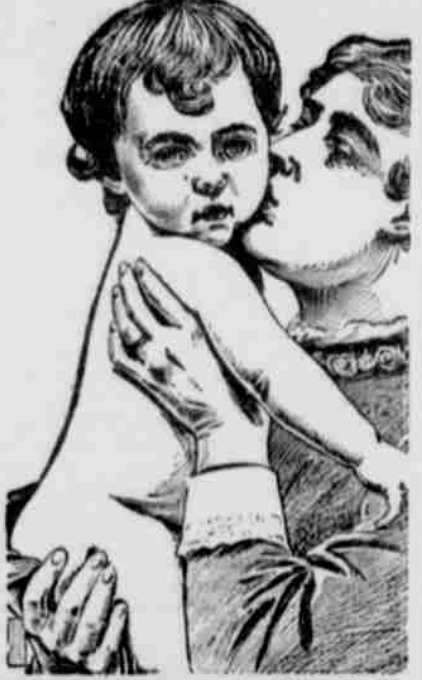
Pure and Sweet are the Skin, Scalp, and Hair of Infants Purified and Beautified by