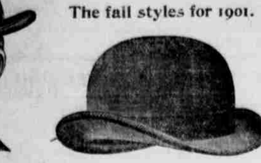
The "Elk" Fedora.