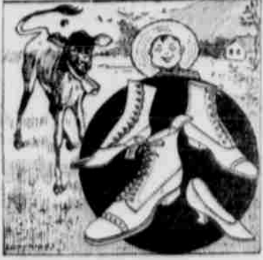
CALF AND KID

shoes of the most desirable styles and shapes adorn the windows and shelves of our store. Its a moral certainty that we can please you as to fit, comfort and fashion. We have made every precaution for spring and summer, and await your visit with perfect confidence of our ability to suit you.