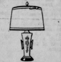
Lamp with white porcelain base. Solid maple trim. Shade of linen finish parchment.