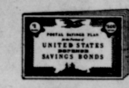
$100 Defense Savings Stamps may now be obtained through Brown & Williamson. Send 133 Raleigh coupons for each dollar stamp. Defense Stamp Album, shown above, free on request.