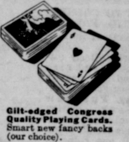
Gilt-edged Congress Quality Playing Cards. Smart new fancy backs (our choice).