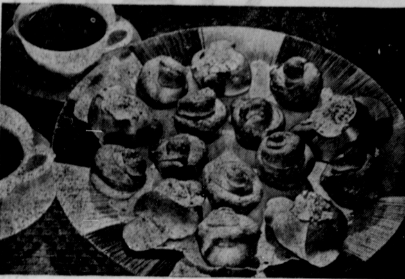
Welcome at a Housewarming—Honey Twist Rolls (See Recipes Below)