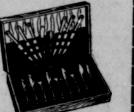
Inside Community Chest Plates Silverware, 23 pieces and walnut finish wood chest.

TRY A PACK OF RALEIGHS. They're a grand blend of 31 selected grades of choice Turkish and Domestic tobaccos—made from the more expensive, more golden colored leaves that bring top prices at the great tobacco sales. And that coupon on the back of every pack is good in the U. S. A. for luxury premiums. Switch to popular-priced Raleighs today and write for the premium catalog.