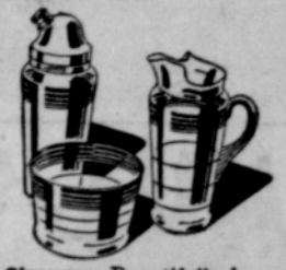
Glassware, beautifully decorated. Platinum bands. Shaker; Pitcher; Ice bowl.