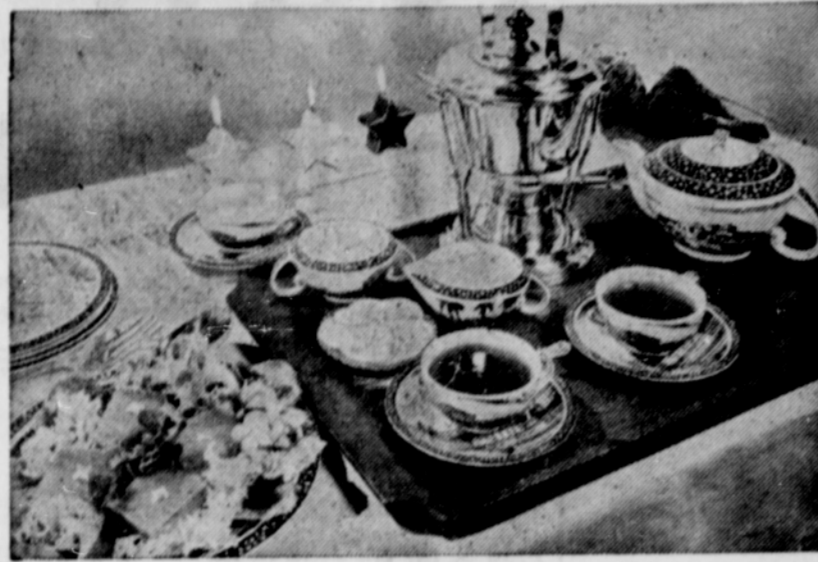
... TO THE CLASS OF '41! (See Recipes Below)