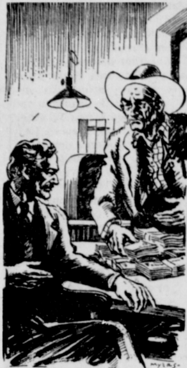
Morgan argued, "I can't put fifty thousand dollars in this old safe, Tom."

Afterwards Virgie Morgan looked back on those three years, trying to separate phases, distinguish definite epochs of despair, as a person who has emerged alive from an inundation or a frightful wreck tries to recall incidents of that catastrophe, decide what came first and what