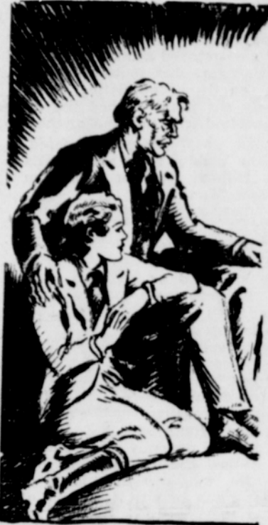
His voice was emotionless now as the stark tale came to an end.

Throughout the interminable night Autumn knelt at her window in the darkness, watching the stars wheel across the sensuous velvet of a sky lately cleared of rain, until at last the blood red sail of a waning moon stood in the west, and she knew it was only a brief hour or so before dawn. Cramped with chill, she crept back into bed. In the fitful sleep that came to her, she dreamt that Bruce Landor was dead, and that somehow she had caused his death. She awoke to a thin, gray daylight, to find that her face was wet with