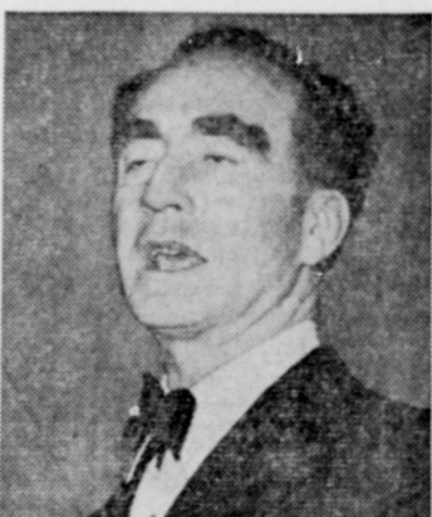
FRANK MURPHY Strategic moment?

Observers disliked impugning the motives of Attorney General Frank Murphy and his trust-busting assistant, Thurman Arnold, but they picked a strategic moment to open a graft crusade in Chicago which may end up by out-Deweying Tom Dewey's cleanup of New York.