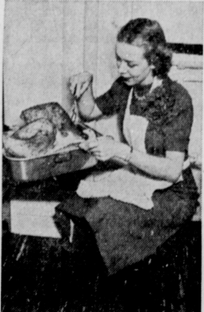
Allow 20 to 25 minutes to the pound for roasting bird in 325-degree oven.

Flowers, while more expensive, make a beautiful table. An arrangement of pompon chrysanthemums and red roses in a low bowl, bedded by sprays of long-needle pine and frosted with cones is particularly attractive. A bit of holly gives it a definite Christmas air. The entire arrangement needs few more than a dozen flowers. Such an arrangement should be kept low so it will not hide the folks across the table. For a long table, make the arrangement long; for a round table, make it round.