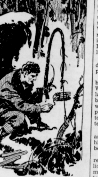
Lighting a Match, He Held It to the Fuses.

"Completely—?" Warren echoed. His face, sullen and haggard, lit up at this unexpected mercy. He