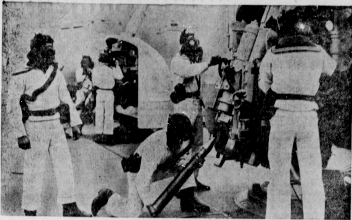
Gunners aboard the "pocket battleship" Koenigsberg are shown manning the guns during a gas mask drill. With international incidents occurring over shipping in Spanish waters, the German navy is preparing itself for possible eventualities.