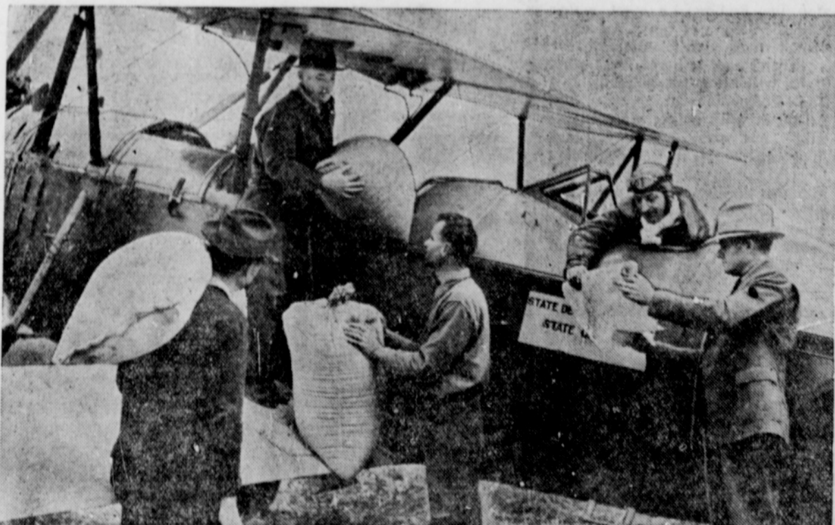
One of the former mail planes used by the government which is now being used to scatter seed over burned-over forest land. The compartments once used for mail have been rebuilt as seed bins with trap doors in the bottoms which can be released by the pilot. The planes carry about 800 pounds of seed.