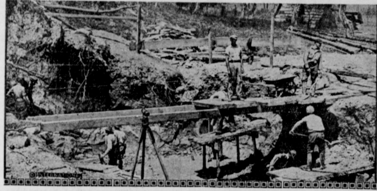
Liquors, whisky and brandy were made for home consumption at George Washington's still house near his mansion at Mt. Vernon. Workmen are shown repairing the historic structure as well as the old mill, some of the timbers of which have been unearthed and can be seen quite plainly,