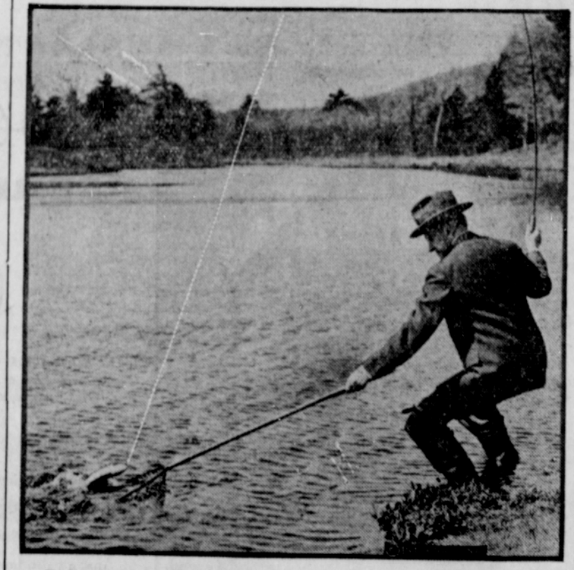
Ex-President Coolidge tried the trout fishing in the private preserve of former Senator George McLean of Connecticut the other day, and news photographers were permitted to make pictures of him there. Above he is seen capturing a fine fish.