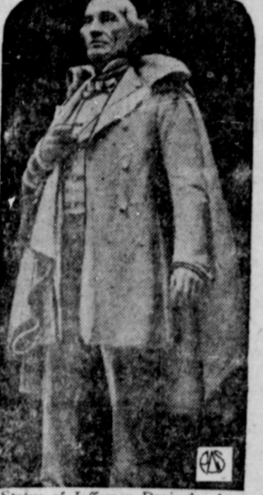
Statue of Jefferson Davis, by Augustus Lukeman, gift of the State of Mississippi, just accepted by Congress and placed in Statuary Hall in the Capitol at Washington.