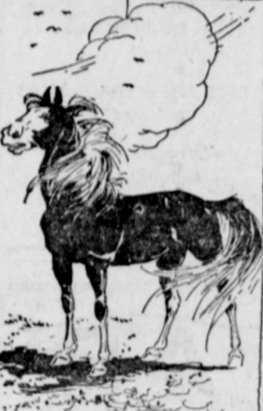
"I Am Always Loved. The Farmer's Children Adore Me."

"NEIGH, neigh, I am a happy horse. I am always so sorry for horses who are not happy. And many I see are not nearly so happy. I know, as I wish they were. "They are given hay to eat, but, oh, dear, they're hit at times and when it is not their fault. Horses aren't lazy. Once in a while they get tired and then they should not be pushed so hard. "But what makes me feel happiest is that I am never given any treatment that isn't of the kindest and the best at all times. I am always loved. The farmer's children adore me. They give me sugar and they kiss me and they pat