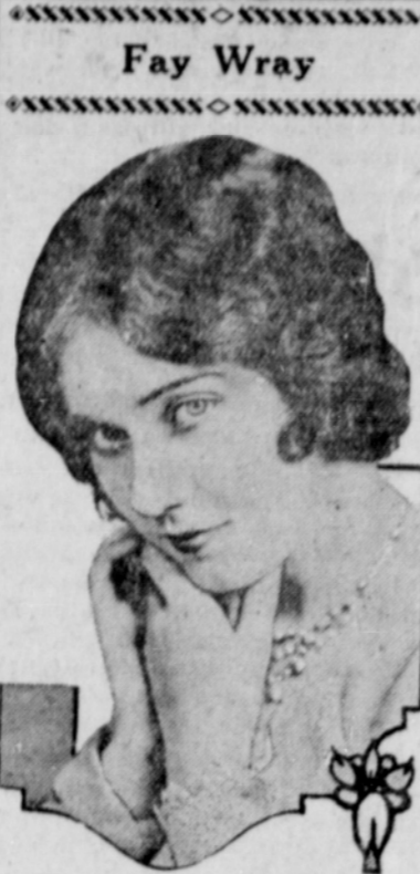
This new screen star has the leading role in "The Wedding March." Miss Wray is regarded in motion picture circles as the find of the year.