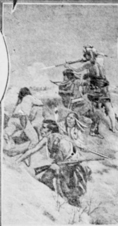
The Sheepeaters at Bay