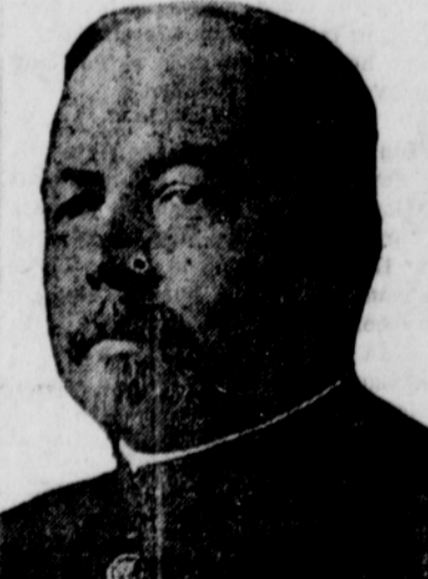
General Funston, who is in command of the American troops along the Mexican border.