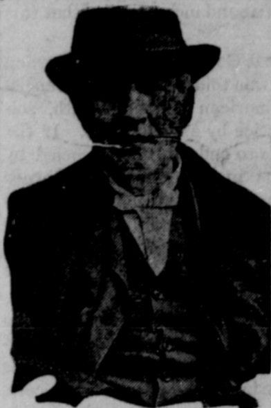
Thomas A. Edison, noted inventor who has accepted an invitation to head an advisory naval board of civilian inventors.