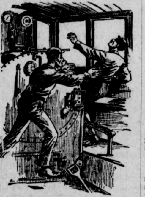
DEATH AT THE THROTTLE.

here the fireman reached forward and touched the engineer's arm. He sprang back with a startled look on his face; then he jumped forward and with both hands shook the engineer. Then the fireman knew why the train had sped over the crossings without whistling and why it had run past stations where it stopped every day. The engineer was dead. The fireman sprang to the throttle and brought the train to a stop as it was entering the next town. A physician was hurriedly summoned, but he was too late to be of any service. He said the man had been dead for nearly an hour. "Heart failure" was his verdict. The fireman ran the train until it arrived at one of the larger towns, where another engineer was taken on to finish the trip.