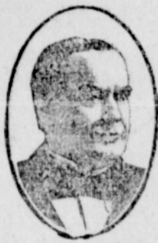
Wm. McKINLEY, OF OHIO.

For Vice-President, THEO. ROOSEVELT, OF NEW YORK.