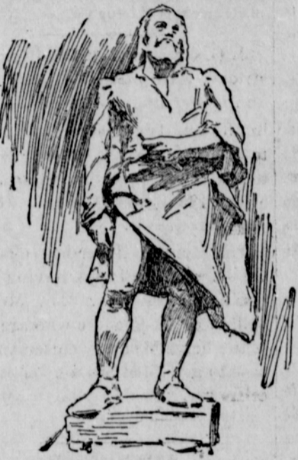
THE ANGELO STATUE.

The creator of the statue, Paul Wayland Bartlett, is an American who went