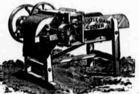
Ross Feed Cutter, guaranteed best in the World.

We carry the largest stock in the Northwest of Buggies, Carriages, Carts, Spring Wagons, and Vehicles of all kinds at prices to suit everybody. It will pay all intending purchasers to call and examine our stock and obtain prices.