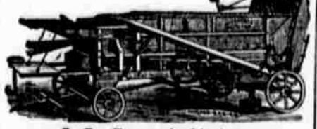
J. I. Case Agitator.

Runs lighter, threshes faster, is less liable to get out of order and saves grain better than any other Thresher.