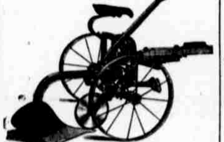
J. I. Case Sulky, Gang and Walking Plow, Harrows and Cultivators.

Force Feed Drills and Seeders, with Truss Axle and Wide Tires.