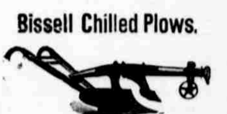
Bissell Chilled Plows.

Warranted better built and better working than any other Chill Plow made.