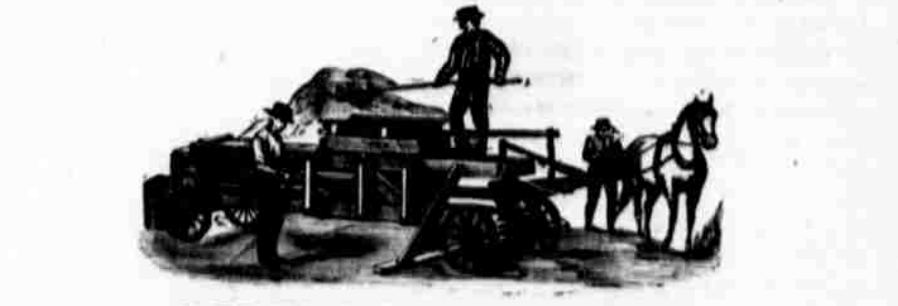
DEDERICK HAY PRESS:

Warranted better built and better working than any other Chill Plow made.