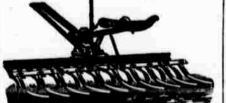
Acme Harrow, Clod Smasher, Crusher and Leveler.

End Spring, Side spring, Brewster spring, Timken spring Buggies and all kinds of Carriages and Vehicles.