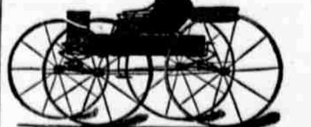
Buggies and Carriages.

Runs lighter, threshes faster, is less liable to get out of order and saves grain better than any other Thresher.