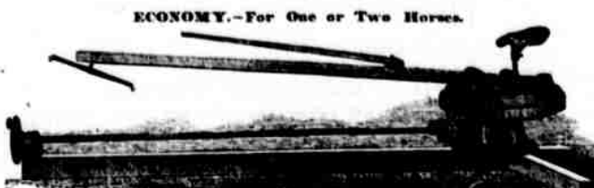
ECONOMY—For One or Two Horses.

They are very effective in light winds, and ordinary violent storms will not injure them. They are always under perfect control, run steadily, and are very powerful.