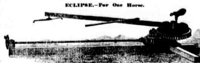
ECLIPSE—For One Horse.

These Wind Mills were adopted four years ago by the Pacific R. R. Co., and are now in general use on their roads, the best Eastern Mills having proved unsatisfactory.