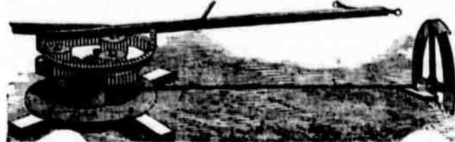
MONITOR—For Two or Four Horses.

Pioneer and Largest Manufacturer of the above Machinery on the Pacific Coast. FACTORY, Cor. Market & Beale Sts. SAN FRANCISCO.