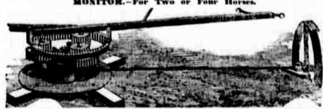
MONITOR--For Two or Four Horses.

Pioneer and Largest Manufacturer of the above Machinery on the Pacific Coast. FACTORY, Cor. Market Beale Sts. SAN FRANCISCO.