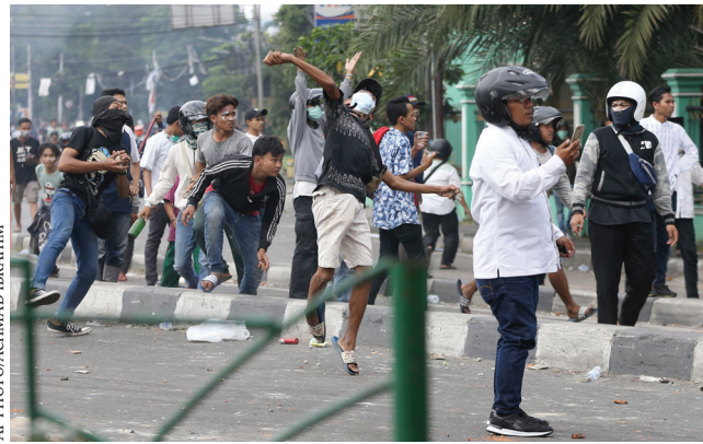
Supporters of the losing presidential candidate throw rocks at police Wednesday, May 22, 2019, in Jakarta, Indonesia. A number of people have died and dozens of vehicles burned as rioters took over neighborhoods in central Jakarta, throwing rocks and Molotov cocktails at police who responded with tear gas, water cannon and rubber bullets.

Rudiantara, the communications and information technology minister, said features of social media including Facebook, Twitter and WhatsApp will be restricted on a temporary basis to