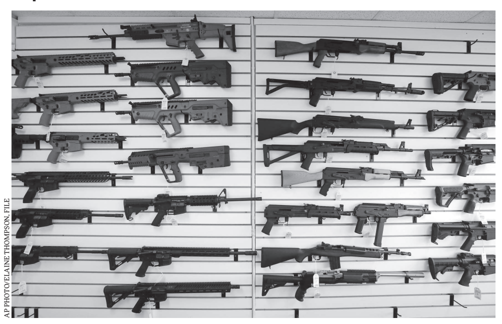
In this photo taken Oct. 2, 2018, semi-automatic rifles fill a wall at a gun shop in Lynnwood, Wash. A dozen county sheriffs in Washington state are refusing to enforce restrictions on semi-automatic rifles that voters approved in November. They say the new law might be unconstitutional, and they're waiting for the courts to weigh in.

Initiative supporters say they are disappointed but noted the sheriffs have no role in enforcing the new restrictions