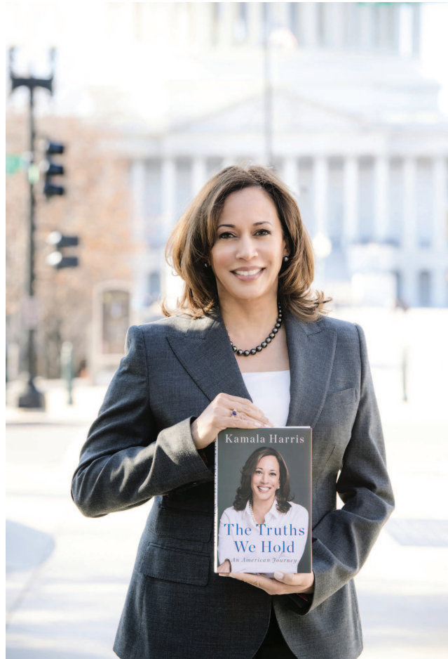
Kamala Harris, U.S. Senator, California - D

The Truths We Hold An American Journey by Kamala Harris Penguin Press Hardcover, $30. 336 pages ISBN: 978-0-525-56071-5