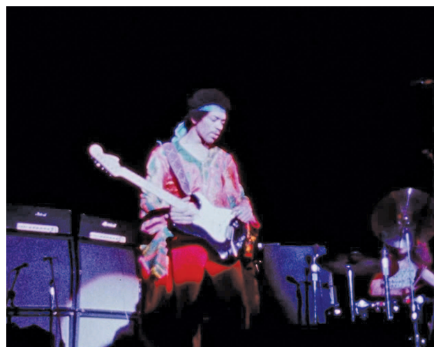
Jimi Hendrix: Electric Church