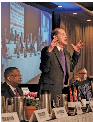
Senator Wyden addresses the crowd at The Skanner Foundation MLK Breakfast