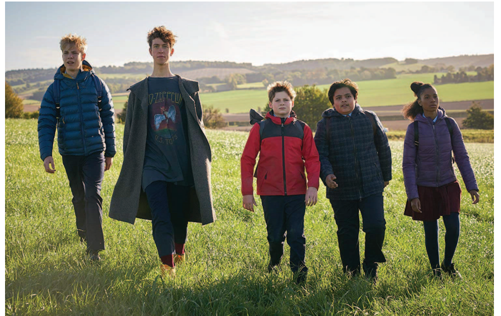
'The Kid Who Would Be King'

Jihadists (Unrated) Radical Islam around Africa is explored in this jaw-dropping documentary exposing the radical ideology indoctrinating thousands from Timbuk-