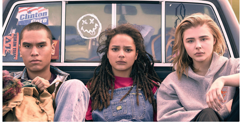
The Miseducation of Cameron Post

The Miseducation of Cameron Post (Unrated) Chloe Grace Moretz plays the title character in this adaptation of Emily M. Danforth's coming-of-age novel of the same name, set in 1993, about