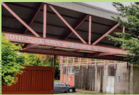
Exterior of Harriet Tubman Middle School.