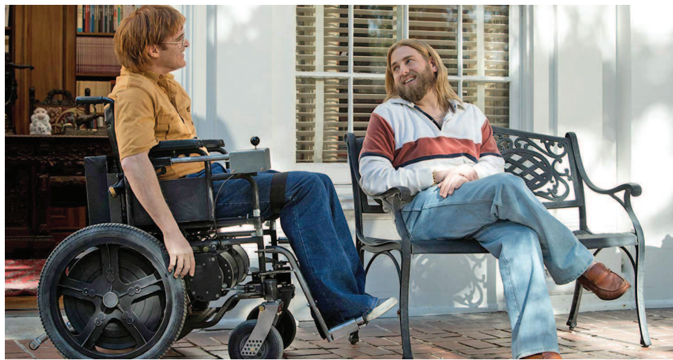
'Don't Worry, He Won't Get Far on Foot'