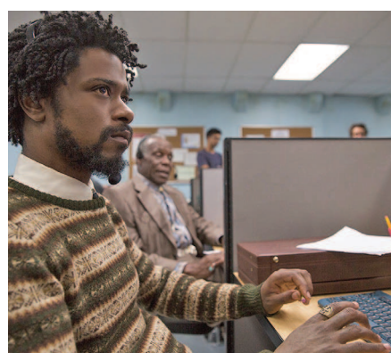
Lakeith Stanfield as Cassius Green