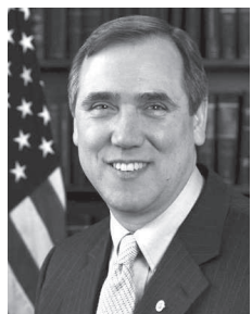
Sen. Jeff Merkley

The 68-year-old Republican was a longtime member of the Oregon House before being elected statewide office in 2016.