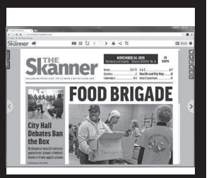
Page through the print edition online.