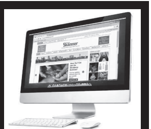
Enjoy an in-depth read on your desktop.