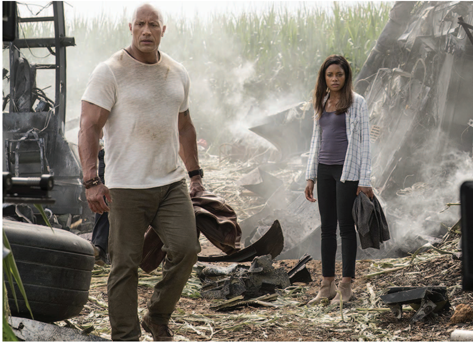
Dwayne Johnson and Naomie Harris in 'Rampage'

But instead of decimating Tokyo, the gargantuan creatures here have