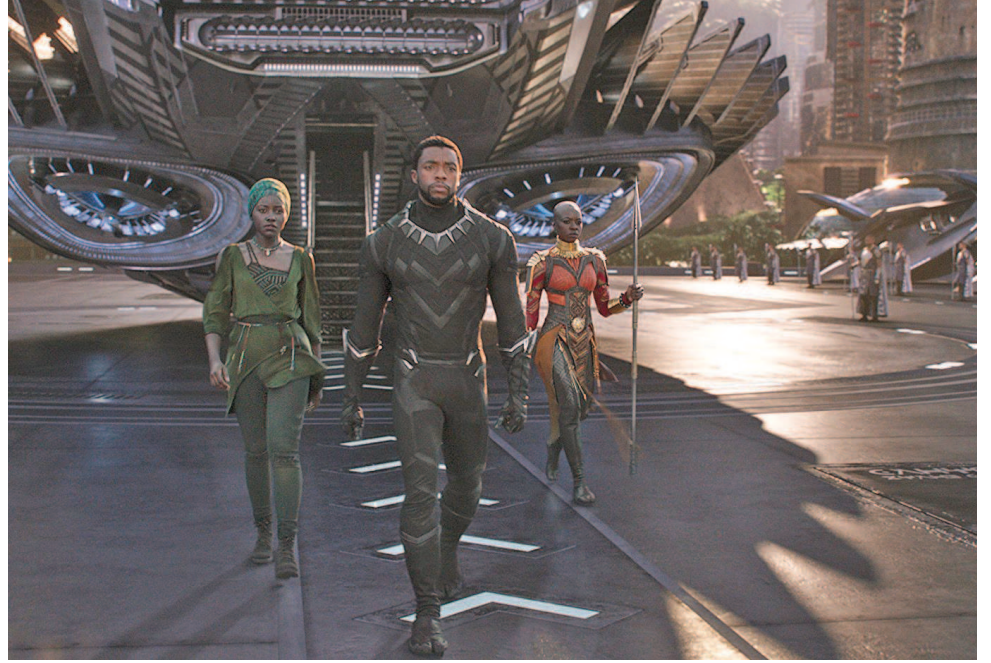
Excitement over the African superhero movie 'Black Panther' has driven unprecedented early ticket sales

Loveless (R for profanity, graphic sexuality, frontal nudity and a disturbing image) Dysfunctional family drama, set