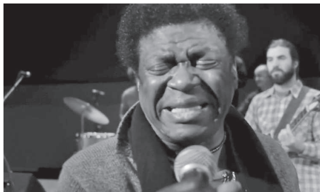
'Charles Bradley: Soul of America'