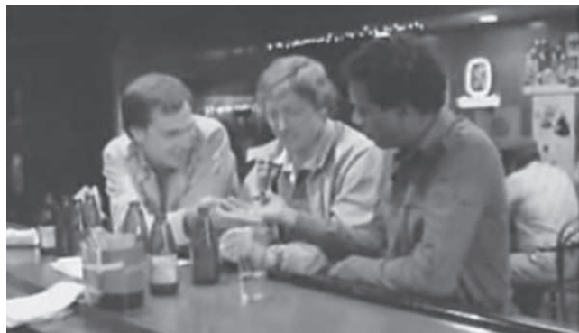
'Brother From Another Planet' (1984)