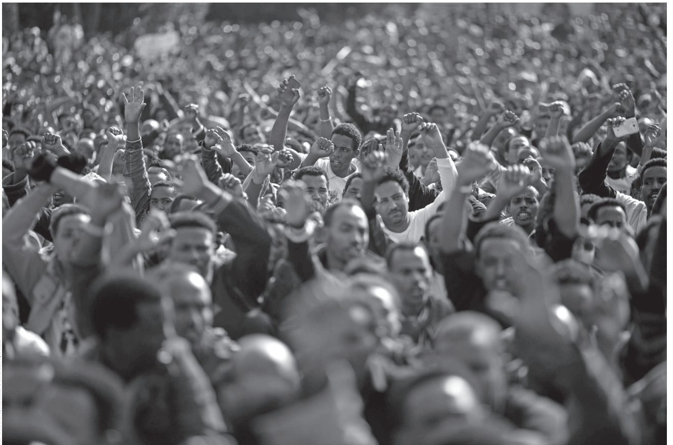
In this Jan. 5, 2014 file photo, African migrants chant slogans during a protest in Rabin Square, in Tel Aviv, Israel. An Israeli government plan to deport tens of thousands of Africans fleeing danger has sparked an unexpected backlash from liberal Israelis and their American Jewish allies who say Israel, established in the wake of the Holocaust, should never be turning away those in need.

Advocates dispute that, noting Israel's poor record of processing refugee requests. They note that of some 15,000 African refugee status requests, only 11 have been