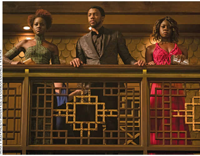
This image released by Disney and Marvel Studios' shows Lupita Nyong'o, from left, Chadwick Boseman and Danai Gurira in a scene from "Black Panther," in theaters on Feb. 16, 2018.

Existing in the same shared universe as Iron Man, the Hulk, Captain America and Spiderman, the Panther, however, the Black Panther's adventures center around his futuristic hidden homeland of Wakanda, considered to be the most technologically advanced nation on Marvel's earth. In the new movie, T'Challa, the Black Panther's real name, must battle long-time adversaries with the aid of his all-female bodyguards and a CIA agent to maintain