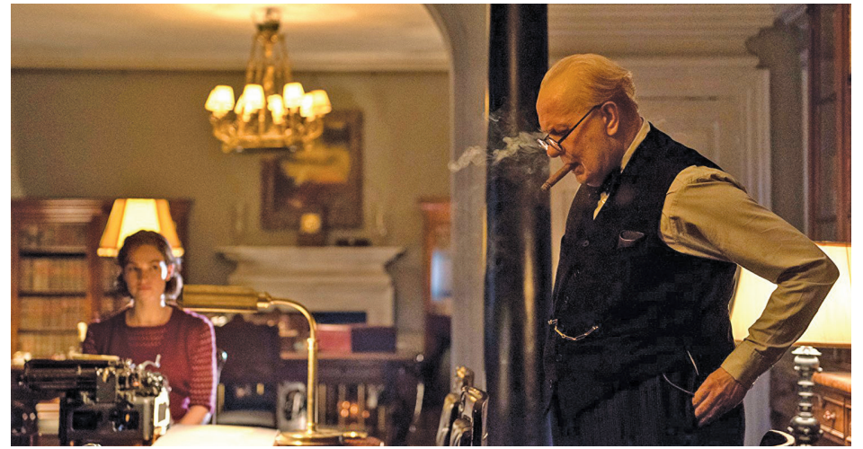
The Darkest Hour'