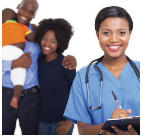
Open enrollment for health insurance runs for 45 days, from Nov. 1 to Dec. 15.