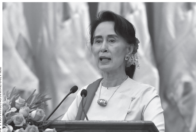
In this Friday, Aug. 11, 2017 photo, Myanmar's State Counsellor Aung San Suu Kyi delivers an opening speech during the Forum on Myanmar Democratic Transition in Naypyitaw, Myanmar. Suu Kyi has canceled plans to attend the U.N. General Assembly, with her country drawing international criticism for violence that has driven at least 370,000 ethnic Rohingya Muslims from the country in less than three weeks.

Suu Kyi was missing the assembly, which opened Tuesday and runs through Sept. 25, in order to address domestic security issues,