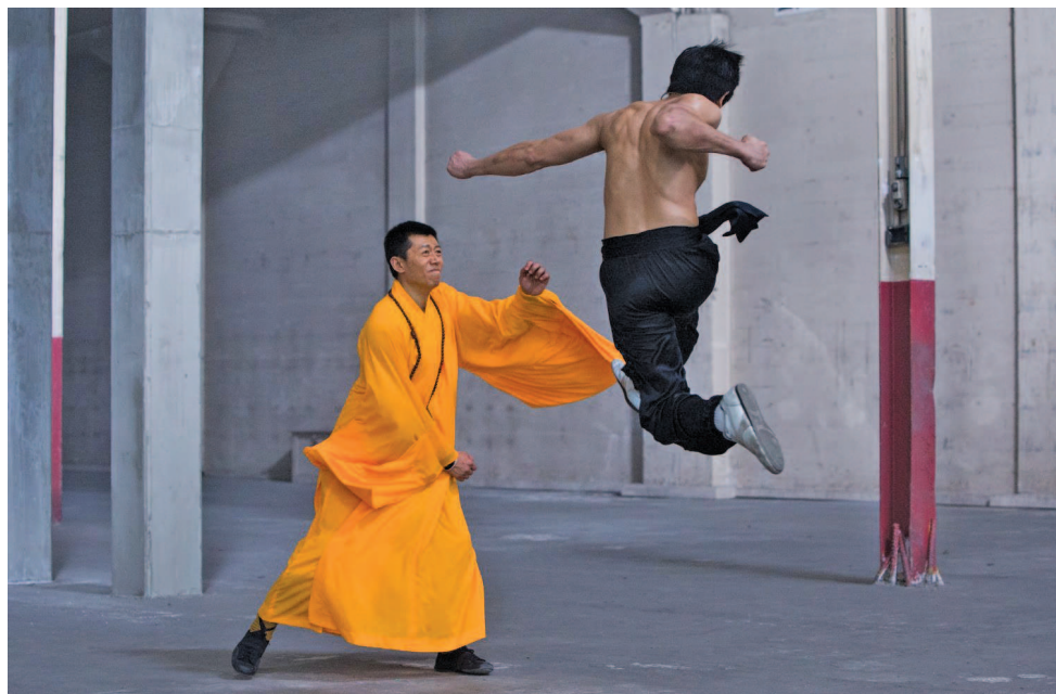
'Birth of the Dragon'

in the biopic, set in San Francisco in the 1960s and revolving around a showdown between the martial arts legend and a kung fu master (Xia Yu). Cast includes Billy Magnussen, Xing Jing and Terry Chen. (In English and Mandarin with subtitles)