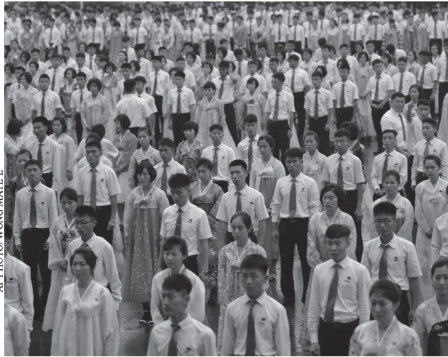
North Korean university students wait for the start of a mass dance on July 27 in Pyongyang, North Korea as part of last week’s celebrations for the 64th anniversary of the armistice that ended the Korean War.

“Our country’s national defenses have been strengthened and the U.S. has been viciously clinging to sanctions, so I think there is much more of a possibility of the U.S. provoking us now. But I’m also very confident of