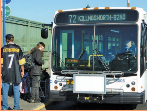
Portland commuters board TriMet bus.