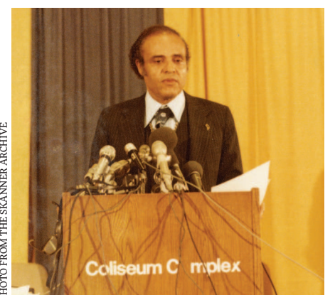
The NAACP Portland Branch put in a bid this week to host the organization's national convention in 2020. Portland hosted the 69th National Convention in 1978 at Memorial Coliseum. Pictured here speaking at that event is Benjamin Hooks, who served as executive director of the NAACP from 1977 to 1992.